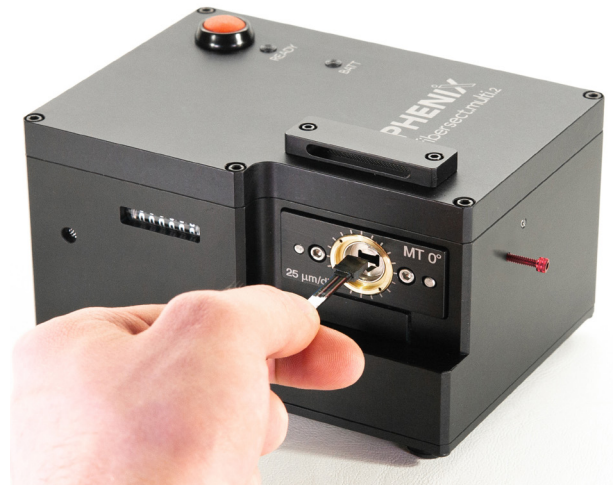
Inserting the MT ferrule

The fibersect.multi.2™ quickly cuts off the epoxy and fibers protruding from the face of connector ferrules during the installation process. In less than one second, it produces a flat cut close to the MT ferrule face, creating the ideal surface for polishing. Throughput is improved by eliminating manual steps such as hand cleaving, de-nubbing and epoxy removal. The multi.2 is optimized for cutting 4 to 72 fiber MT ferrules as well as large diameter fibers used with SMA connectors. With a simple one button operation, small footprint, and battery power, the fibersect.multi.2 provides exceptional versatility, portability, and ease of use in the production environment.