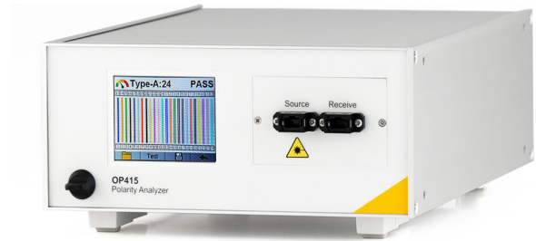
Model OP415 Polarity Tester

The OP415 Polarity Analyzer provides multiple capabilities for your MTP®/MPO cable production and R&D facilities.