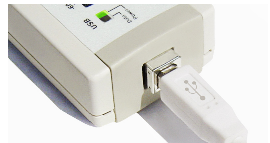
USB-powered and controlled