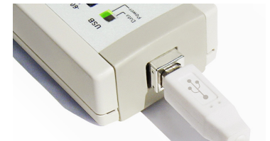
USB-powered and controlled